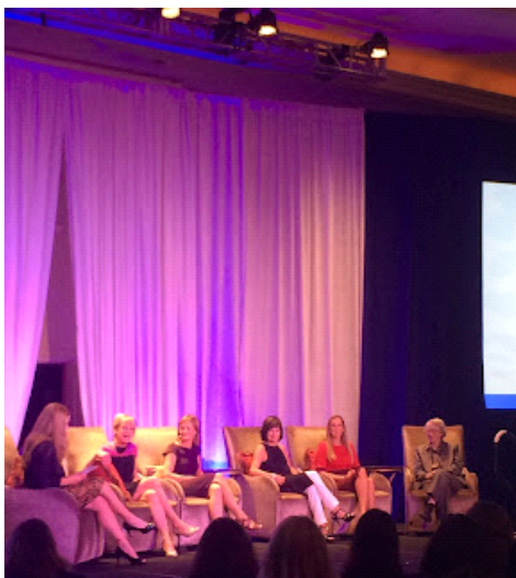
Star studded panel of Circuit Judges

A star studded panel of Federal Circuit Judges followed, with the Circuit Judges sharing stories of their career trajectories and advice to the audience. The AmeriKat was struck by the sheer number of women judges from one court that deals with patent cases and looks forward to the day when the English Patents Court has a similar composition.