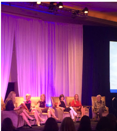
Star studded panel of Circuit Judges

A star studded panel of Federal Circuit Judges followed, with the Circuit Judges sharing stories of their career trajectories and advice to the audience. The AmeriKat was struck by the sheer number of women judges from one court that deals with patent cases and looks forward to the day when the English Patents Court has a similar composition.